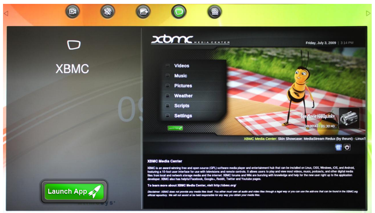
Figure 3: Application Information Window

Once an application is "highlighted / selected" an information window opens (Figure 3).